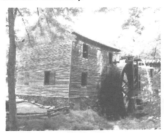
An old water powered grist mill typical of the type owned by Bartholomew

Proprietors, Craven County was considered to be the southern part of the colony, extending below the Cape Fear River to include present-day Georgia and northern Florida and extending to the west as far as the Pacific Ocean!!! It can be argued that all of the existing counties within the state of South Carolina were derived from Craven County. In 1706 the "Parish System" was established, under jurisdiction of the Church of England (Anglican), not only to administer the church's dayto-day activities but also the governmental activities within South Carolina. All courts and records were held in Charles Town (Charleston) until 1768, when seven "Districts", with governmental seats in each district, were established and all counties were eliminated. After the American Revolution, in 1785, South Carolina re-established the concept of counties and 34 "new" counties were established. The area where the Austins lived became Fairfield County.